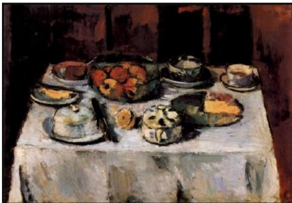
Covered Table, 1916